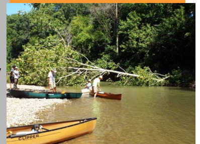
Cleaning up the Wildcat

We have many reports saved for the slow months to enjoy!!