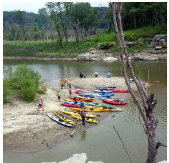
HCC Invasion of Cataract Falls

http://www.hccbulletinboard.org/forums/showthread.php?p=14244#post14244