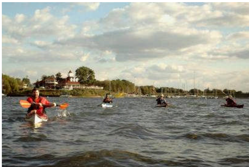
A Fall Paddle on Eagle Creek

On Thursdays, September 2, 9, 16, and 23, I'll be cleaning up Eagle Creek's shoreline and everyone is welcome to join me. Trash bags will be provided but bring your own gloves and other protective gear like bug spray. Kayaks aren't very efficient at hauling trash so if you have access to a canoe and can join in, that would be great!