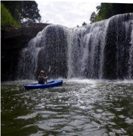
Playing near the Falls

Twenty-seven HCC kayakers and two dogs gathered at Cunot Public Access Site on Cagles Mills Lake to paddle up to the lower falls of Cataract Falls. We all lucked out when rain and storms didn't materialize despite a 40% chance — a welcome contrast to last year's trip. The temperature was also comfortable in the lower 80s.