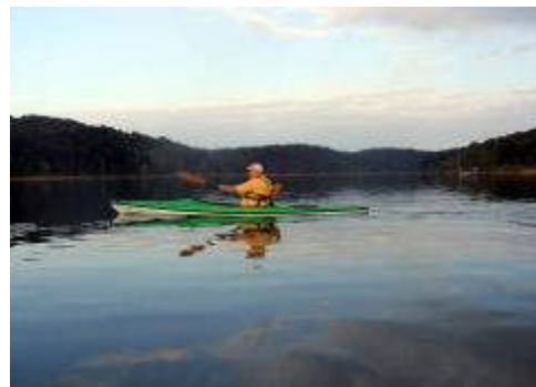
Patoka Lake, September 2009

Note: This is the fastest route. There is a shorter, slower, and more scenic route through West Baden.