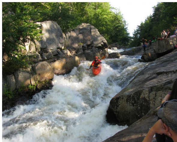
Beaver River—September 2009

On Saturday, there will most likely be several groups planning to run the Upper, Lower, Middle, or all three