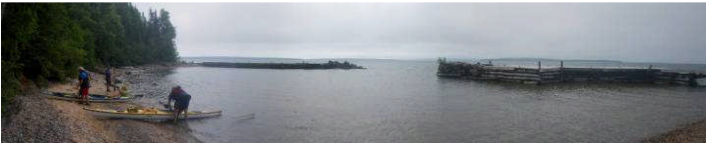
Devils Island Harbor, Apostle Island National Lakeshore, August 2010