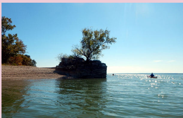
HCKC Trip to Land between the Lakes, October 2019

Learn to Roll After Thanksgiving, pool sessions will move to Saturday morning from 10 am until Noon. Saturday sessions will continue through March. Check the HCKC Training Calendar for details. This is a great opportunity to tune up or learn your combat roll.