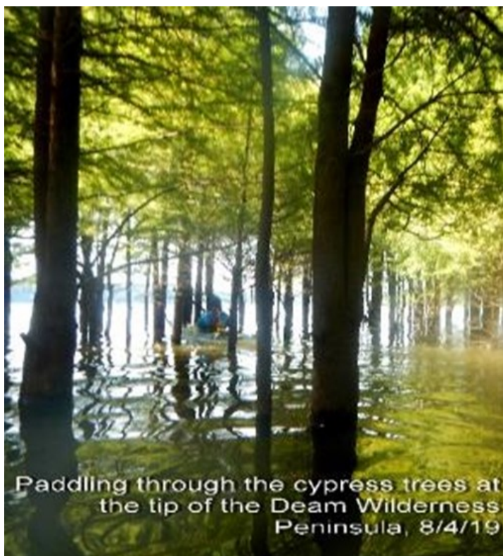
Paddling through the cypress trees at the tip of the Deam Wilderness Peninsula, 8/4/19

When this article is published, we will have returned from our annual Lake Superior pilgrimage. We are going to Pictured Rocks this year! The cliffs there are impressive and there is great paddling throughout the area. I will file a trip report with pictures in the Sea Kayak Forum on the Bulletin Board after we get back.