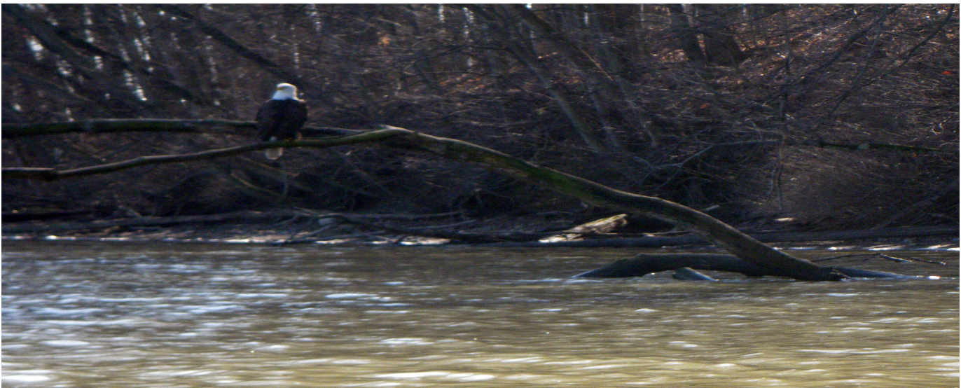
Bald Eagle sighting at Eagle Creek Lake