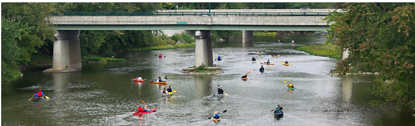
Flotilla leaving Noblesville, Oct. 3, 2009