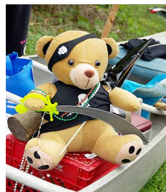
One Really Tough Pirate!

The rain that Indianapolis experienced Thursday and Friday cleared so that people had a great time on the river. One bonus of the rain earlier in the week was that the river's flow level was twice last year's so that every one could make it down the river easily without scraping.