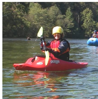
Runner/Player—Jackson 2 Fun Kayak

Other popular boats in this style include the Pyranha Recoil, the Liquid Logic Cross River (CR) series, and the Juice from Dagger (recently replaced by the Rx).