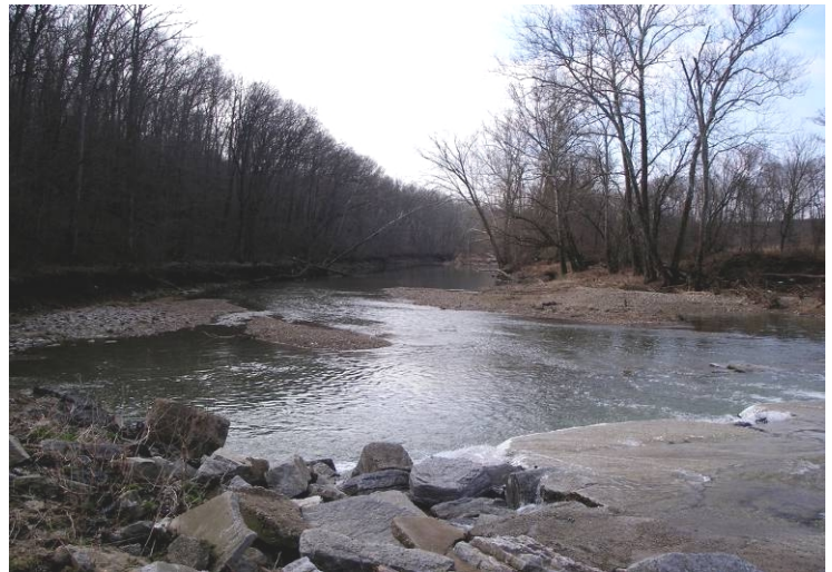
Sand Creek—March 2006 (Ben Swain)

Contact Information: Please call me by 10:00 pm on Friday Night, April 11 to see if an alternate route is planned.