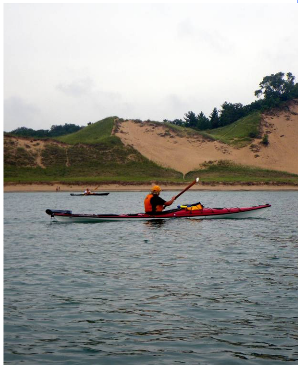
A paddle near Indiana Dune on Lake Michigan

If you have a sea or touring kayak and would like to be added to this group list, please send an e-mail to me