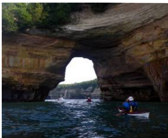
Paddling through Lover’s Leap Arch

On our second day, we drove to Miner’s Beach and paddled about 7 miles East along sandstone cliffs to Chapel Rock. The cliffs are amazing since they loom up to 200 feet over you as you paddle and since they include a wide range of colors giving Pictured Rocks its name. About four miles into our paddle, we came to Lover’s Leap Arch which is easily 100 feet high and big enough for many kayaks to paddle through. After reaching Chapel Rock, we could just see Spray Falls (about 2 miles farther East). Spray Fall is a 70-foot tall water fall that falls into the lake. However,