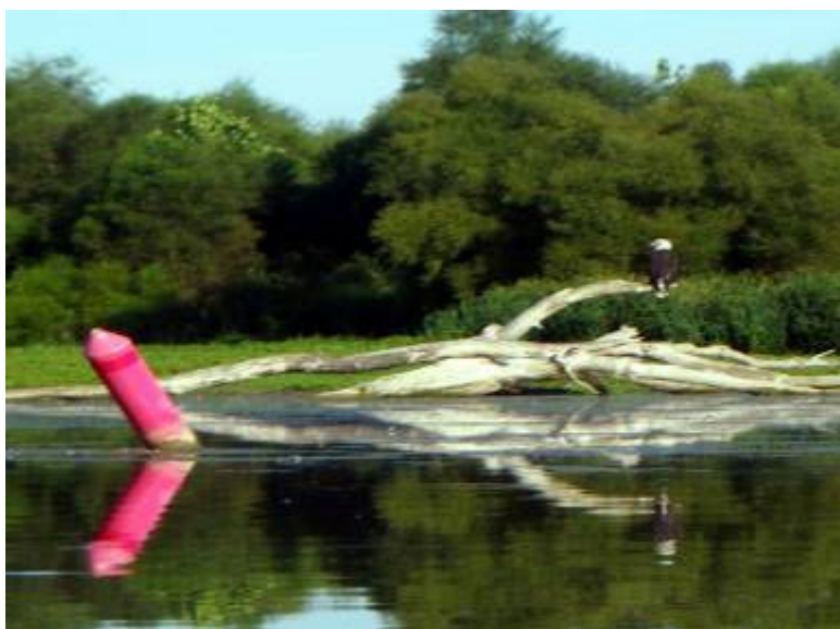
Bald Eagle North of Olio Road on Geist

The Newsletter of the Hoosier Canoe Club