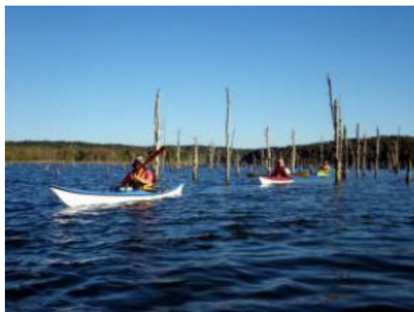
Patoka Lake—October 2010

Since it takes over 3 hours to get to Patoka, we will camp overnight at Fisherman's Camp on Saturday night and paddle both Saturday and Sunday. This campsite is located near a limited speed section of the lake which is more kayak-friendly.