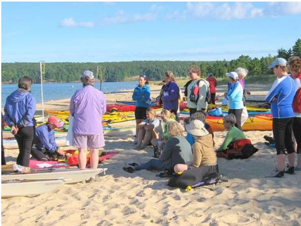
Class receiving instruction

I went with no expectations, other than that I assumed symposiums were very technical involving lots of theory and classroom work. Boy was I wrong! Instruction was lakeside and on the water with a teacher student ratio of one to three. The instructors were from all over the country and were very sophisticated in their teaching styles. They used simple words, provided expert corrections and gave us information on a “need to know” basis. They polled the group at the beginning of each class to ascertain specific needs and then followed up with a debriefing at the conclusion. The emphasis was on boosting skills but with a very fun approach. Lots of illustrations and catchphrases were used to aid memory. “Gorilla Arms” comes to mind. This is the position where your elbows, arms and knuckles are in for the low brace. The sessions I chose were: Paddle Smarter Not Harder, Traditional (Greenland) Paddle, Introduction to the Low Brace, Becoming One with your Boat Through Play, and Potpourri. Some of the other offerings included: Rolling, Sea Rescues, Using a Tow Belt, Packing your Boat for a Trip. Of course boat demos were popular with Impex and P&H (made in the UK) kayaks being most in abundance.