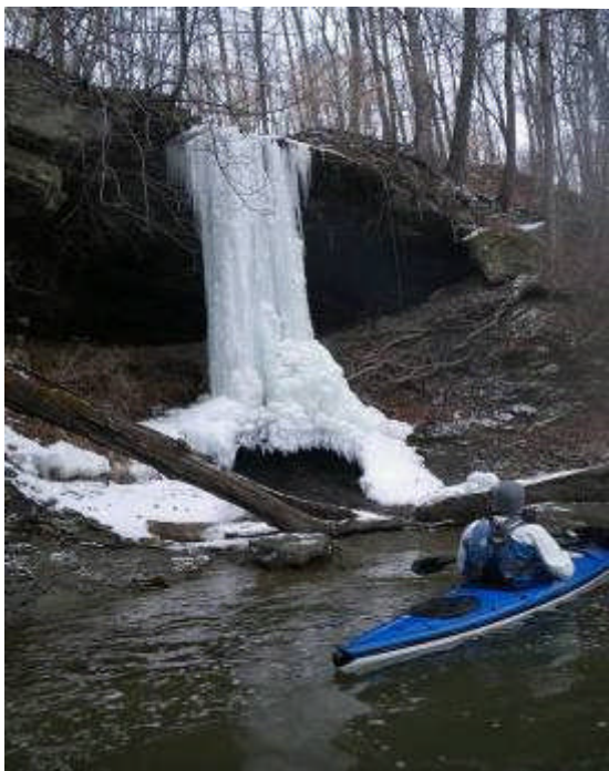
20-30 foot Ice Fall