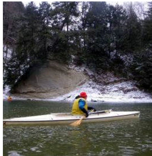
Krueger Sea Wind

problem at the take out since no other parking is close and this limits its viability as a take out. On this trip, we were the only paddlers on the creek and ignored the signs without any problems. There is a Bulletin Board thread on this topic and a several people have been talking with DNR and the State Park about it. One of our officers will be touching base with DNR soon. Ongoing results from discussions with DNR and possible alternative take outs can be seen in that Bulletin Board thread.