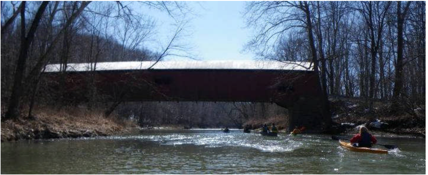
Covered Bridge over Walnut Creek