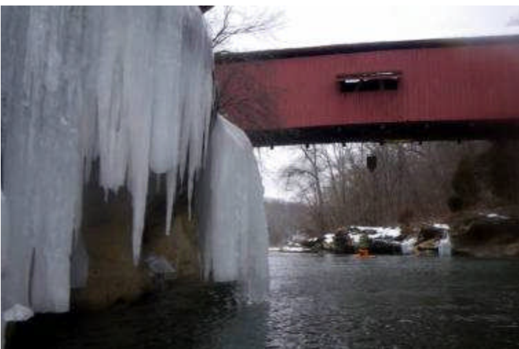
Curtains of ice while paddling into Cox Ford Covered Bridge

All of the parking spots at the take out and put-in have signs limiting parking to 30 minutes. This is not a problem at the put-in since there is long-term parking a quarter mile up the hill. However, this is a