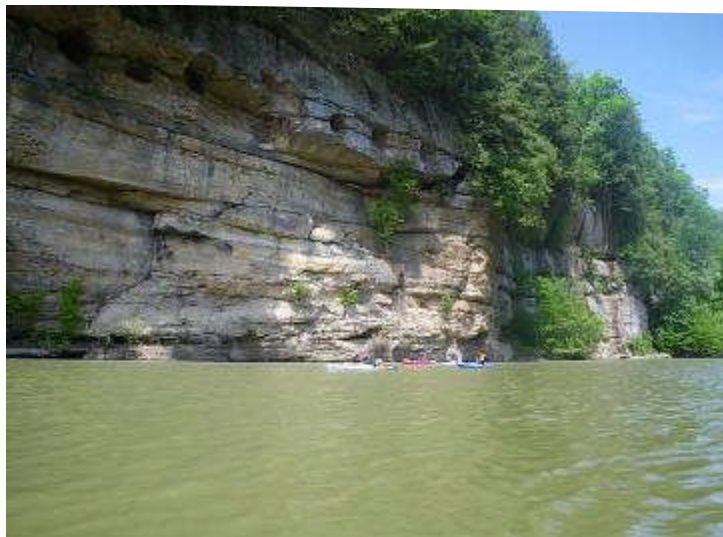
Grayson Lake, May 2009

This year, it's not just a trip – it's a jamboree! That's because Cincypaddlers is partnering with the Elkhorn Paddlers (Frankfort) and Hoosier Canoe Club (Indianapolis), some of the friendliest paddlers you'll ever find. While that's a lot of paddlers, it enables us to break down into sub-groups of those who enjoy various paces. Enjoy the magnificent, wind-carved sandstone cliffs, formations and waterfalls of Grayson Lake (near Ashland, KY). We go every year because it has to be some of the most spectacular scenery east of the Mississippi. See for yourself in these pictures from last year's trip: