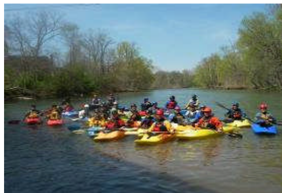
2009 HCC Trip to Elkhorn

Note—Passport Required: You must have a passport to reenter the US, so please keep this in mind when planning for this trip!!! If you don't have a passport, you may want to start applying as soon as possible in order to receive it in time for the trip!