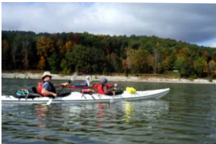
Tandem Sea Kayak

We met at Cutright PAS and then proceeded under the bridge to the West side. We paddled past John Cougar Mellencamp's house and the Paynestown SRA. It was a beautiful day and the waves were reasonable. We then paddled up Morris Creek where we had lunch. After lunch, we paddled south to the Allen's Creek SRA where we set up camp after 9 miles of paddling. We picked a campsite on the North side of the peninsula where Allen's Creek SRA is located – since