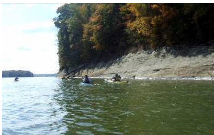
Rocky banks on the West side of Lake Monroe