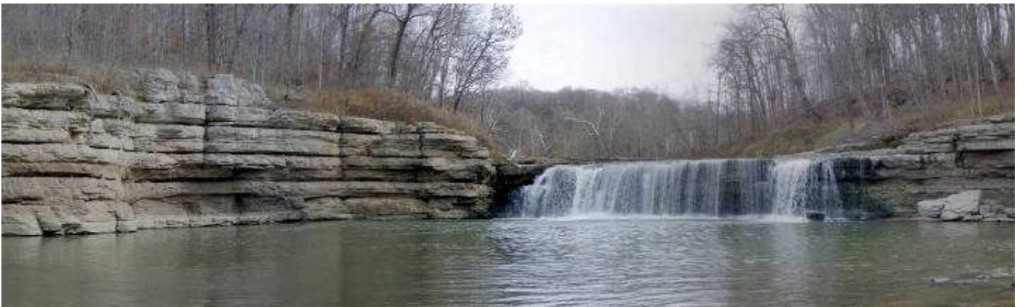
Cataract Falls—November 13, 2009