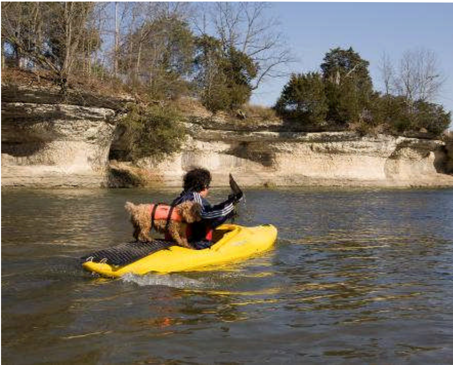
Paddling past the Seven Pillars

Seven Pillars formation, a canoe tipped as it encountered a tight spot. The inevitable gentle ribbing was received with good-natured aplomb. The kayakers from Kokomo joined us for lunch and everyone introduced themselves. It's good paddling practice to know the names and home places of fellow paddlers—it was surprising to learn the wide range of Indiana geography represented.