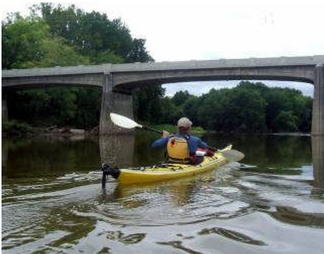
Paddling into Lockport Bridge

put in (630 cfs)—probably too shallow for a fun trip. When he scouted during the week before the trip, the Wabash watershed had seen a lot of rain and the river was rocking and was over 6000 cfs. By the time of our trip, it was 'just right'. (2000 cfs).