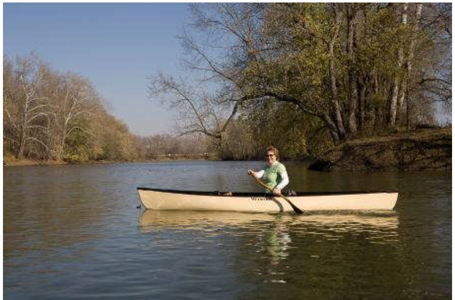
At the confluence of the Mississinewa and the Wabash rivers