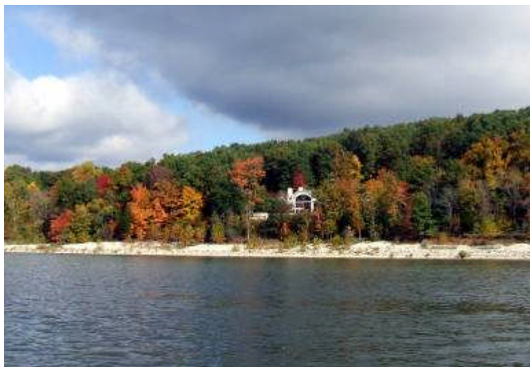
John Cougar Mellencamp's House on Lake Monroe

Eleven sea kayakers showed up to paddle Lake Monroe's wild side – the area west of the Highway 446 causeway. Normally, canoeists and kayakers avoid this area since there is an unlimited boat speed limit and the