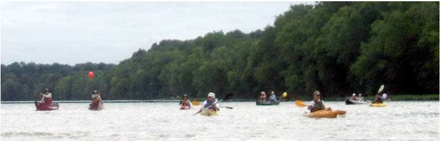
HCC paddling down the Wabash