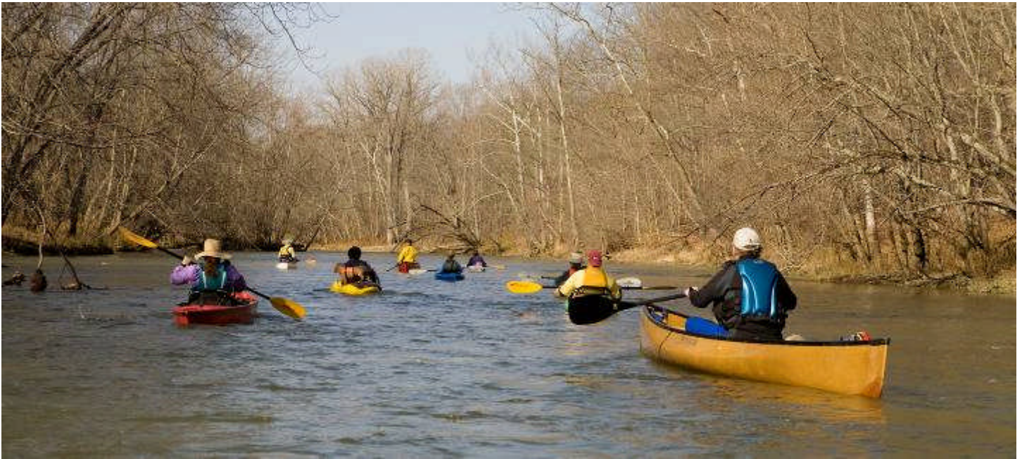
The Mississinewa River