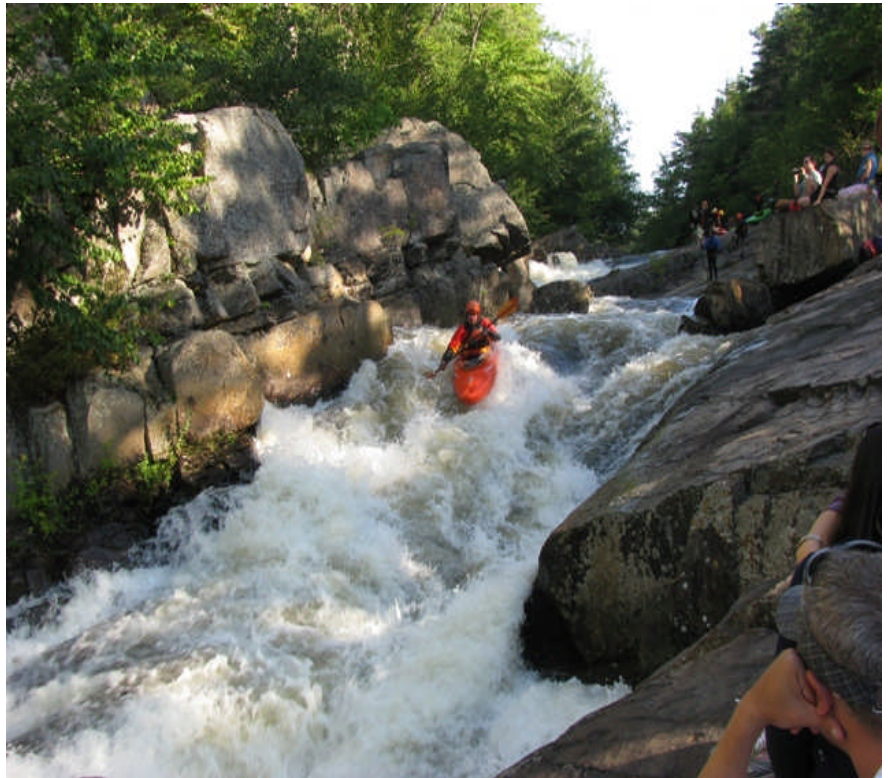
Orange Crush on Beaver River