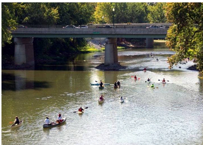
2008 "Pirate Flotilla" taking off from Forest Park PAS

Note: The air and water temperatures may be cold so that cold-weather paddling preparation is recommended.