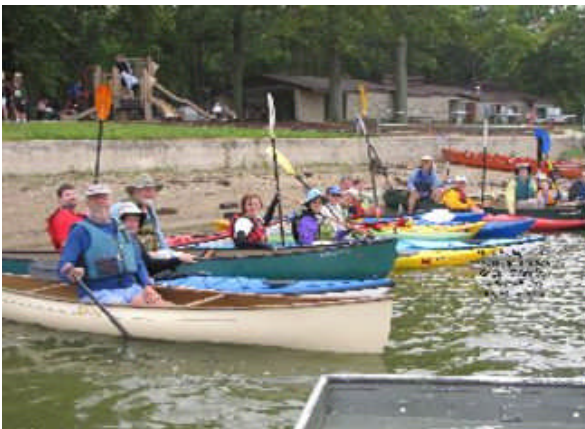
HCC Paddlers at Go Girl Triathlon

Again this summer, the Hoosier Canoe and Kayak Club provided safety boating support for all four of the Eagle Creek Triathlons. While several boaters did directly assist boaters by allowing them to rest on their boats, most of us spent our time 'herding' or keeping participants from swimming an extra mile. We did have one scare – one of the bikes was left unclaimed in the bike corral, so they sent us back out to look for someone. Luckily, that someone was NOT in the water and did eventually let someone know they had decided not to finish. Whew!