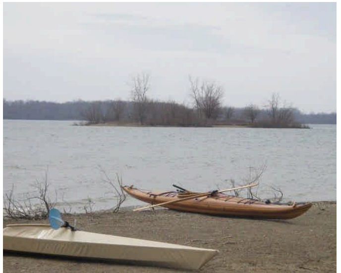
Boats beached for lunch in front of Perch Island

The weather forecast was for rain and thunderstorms in the afternoon and that fortunately didn't materialize until after we had gotten off the water. However, we did enjoy 15+ mph winds after lunch which kicked up 1 foot waves. The winds and waves made paddling interesting but everyone had spray skirts and handled the chop without any problems.