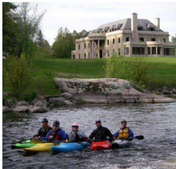
Wisconsin Memorial Day Weekend- 2008