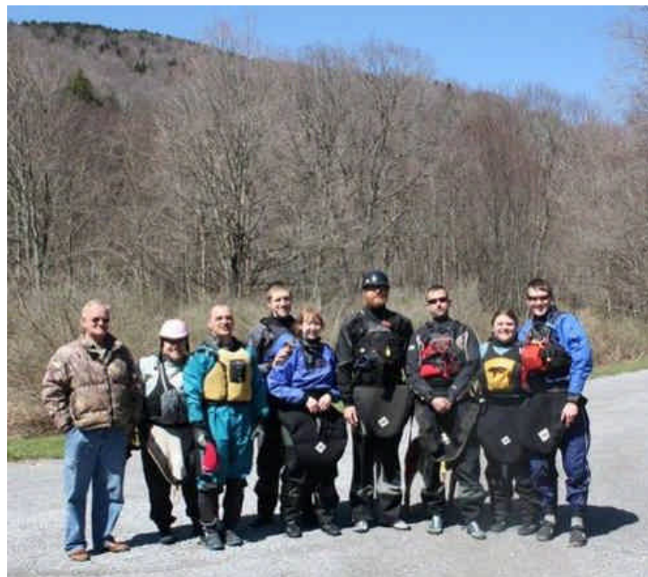
HCC Paddlers ready for the Williams