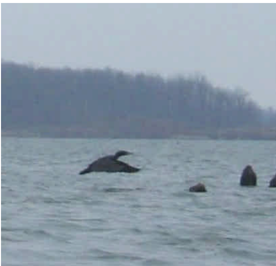
Cormorant taking Flight

everyone had spray skirts and handled the chop without any problems.