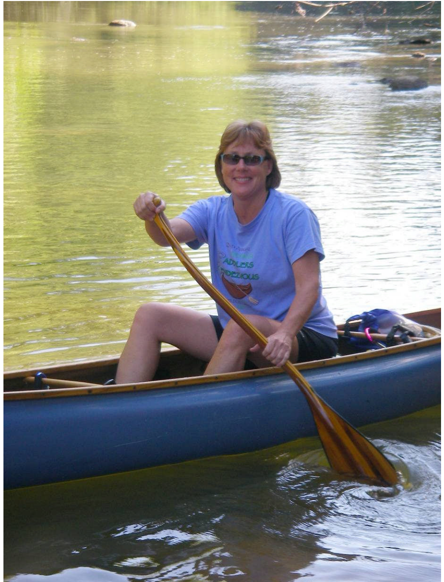
Indiana Paddler's Rendezvous 2008