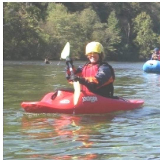
Jackson 2 Fun Kayak

Hip pads, thigh braces, etc. Being snug but comfortable is ideal. Watch the hip pads not to over do them and get