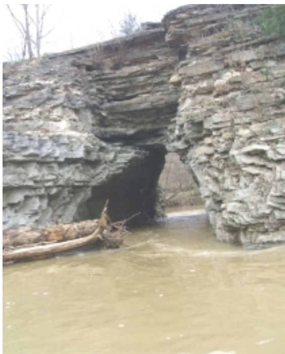
Entrance to Upper Mill Race Cuts off 3/4 mille loop of Sand Creek

On Saturday April 12th, five paddlers from the HCC floated a trip on Sand Creek in the Southeastern counties of Decatur and Jennings. A few inches of rainfall on the preceding day made for a swift current of 3-4 mph. A forecasted rainfall never surfaced but the 20 to 30 mph wind gusts (with temperatures in the mid-40s) made drytops worthwhile.