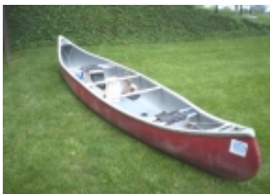
Blue Hole Canoe—For Sale