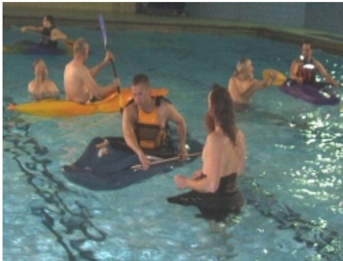
Students at March Learn to Paddle Pool Session

The course fee for ACA members with a valid membership card is $15. The fee for non-members is $20. (Regular ACA membership is $40.) Please be prepared to pay by cash or check prior to the start of the clinic or you will not be allowed to participate due to insurance liability reasons. (The fees cover ACA insurance, registration/reporting of the course, and materials. None of the volunteer instructors profit from these fees.)