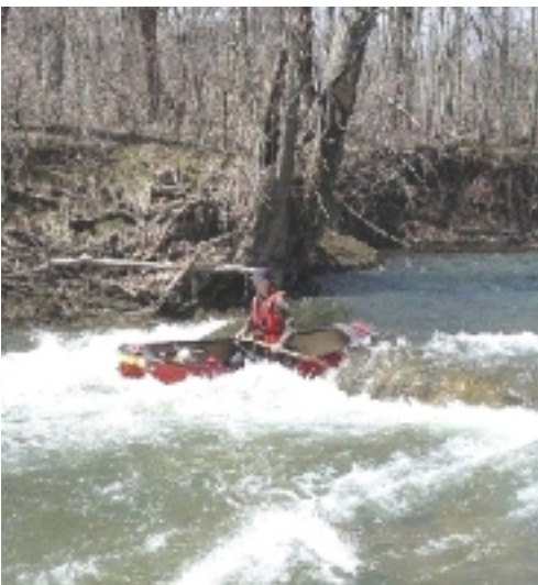
"Killer Falls" at "Lunch Island"

Trips like this one always bring up the question of Large Group vs Small Group. Which is best? Which is more fun? Is one safer than the other? etc, etc. For me, I just don't care!!! "Any group of 1 or more gathered for the enjoyment of the River is a Good Group!!" Big and Small, I like 'em all.